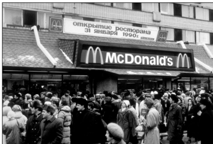
McDonald's Celebrates 26 Years in Russia

One of the world's biggest chains of fast-food restaurants marked its 26th anniversary of business in Russia Saturday, Jan. 31. The first McDonald's was opened in 1990 on Pushkin Square in Moscow, one year before the collapse of the Soviet Union, and became a pioneer for the many foreign food chains that flooded Russia afterward. The restaurant was temporarily closed by the state food safety watchdog in August last year [2015], and reopened in November. Nowadays 471 McDonald's restaurants serve more than 950,000 customers per day in Russia.